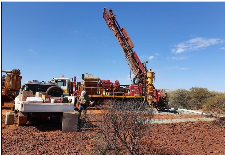
Figure 1: Commencement of RC drilling at Kathleen Valley.