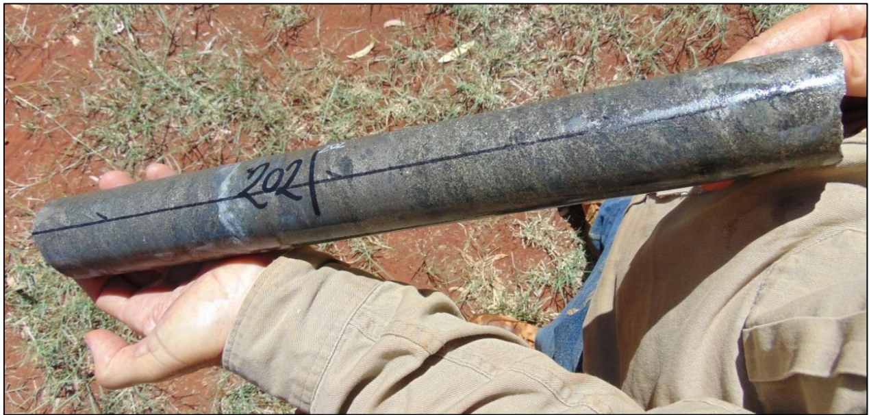
Figure 3: Sulphide, quartz veining and alteration associated with the mineralisation in diamond core hole KVDD013 (201.8-202.4m shown).

Samples for all completed holes have been despatched and are currently being tested at an interstate independent laboratory to speed up the sample turnaround time. Mila expects to have results over the coming weeks and will update investors once they have been collated and interpreted.